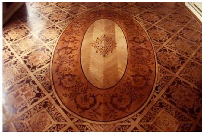
Russian Consulate, New York