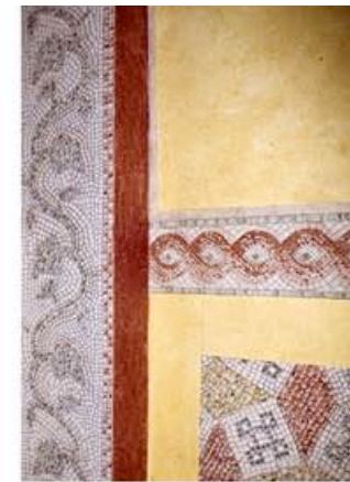
Faux Mosaic on canvas